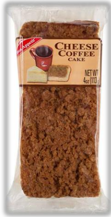
2 varieties bar cakes