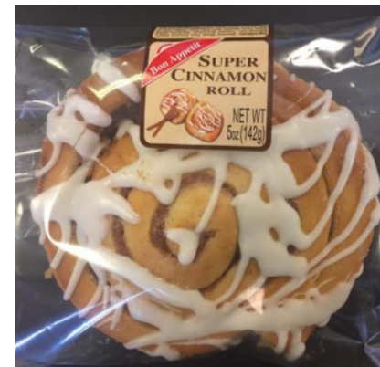
Super Cinnamon Roll