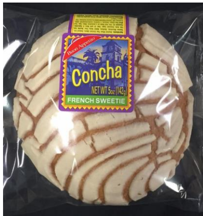
4 varieties Hispanic