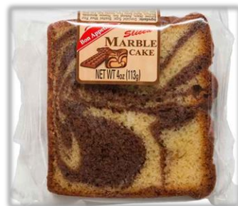
6 varieties sliced cakes