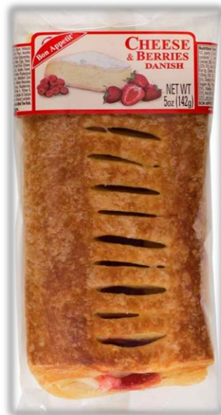
7 varieties danish