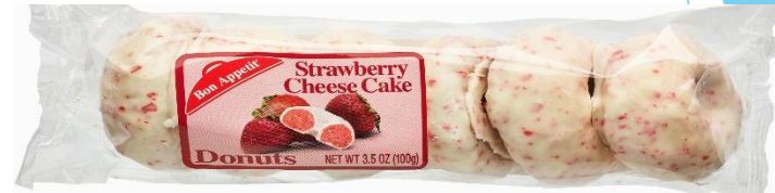
10 varieties of donuts