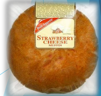
5 varieties muffins